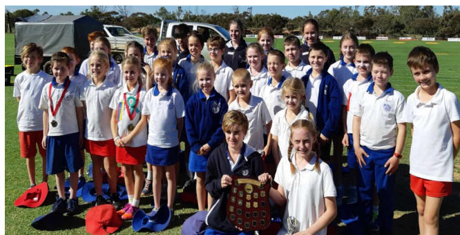
A huge congratulations to the KAMI team on taking out the Championship Shield in their inaugural event